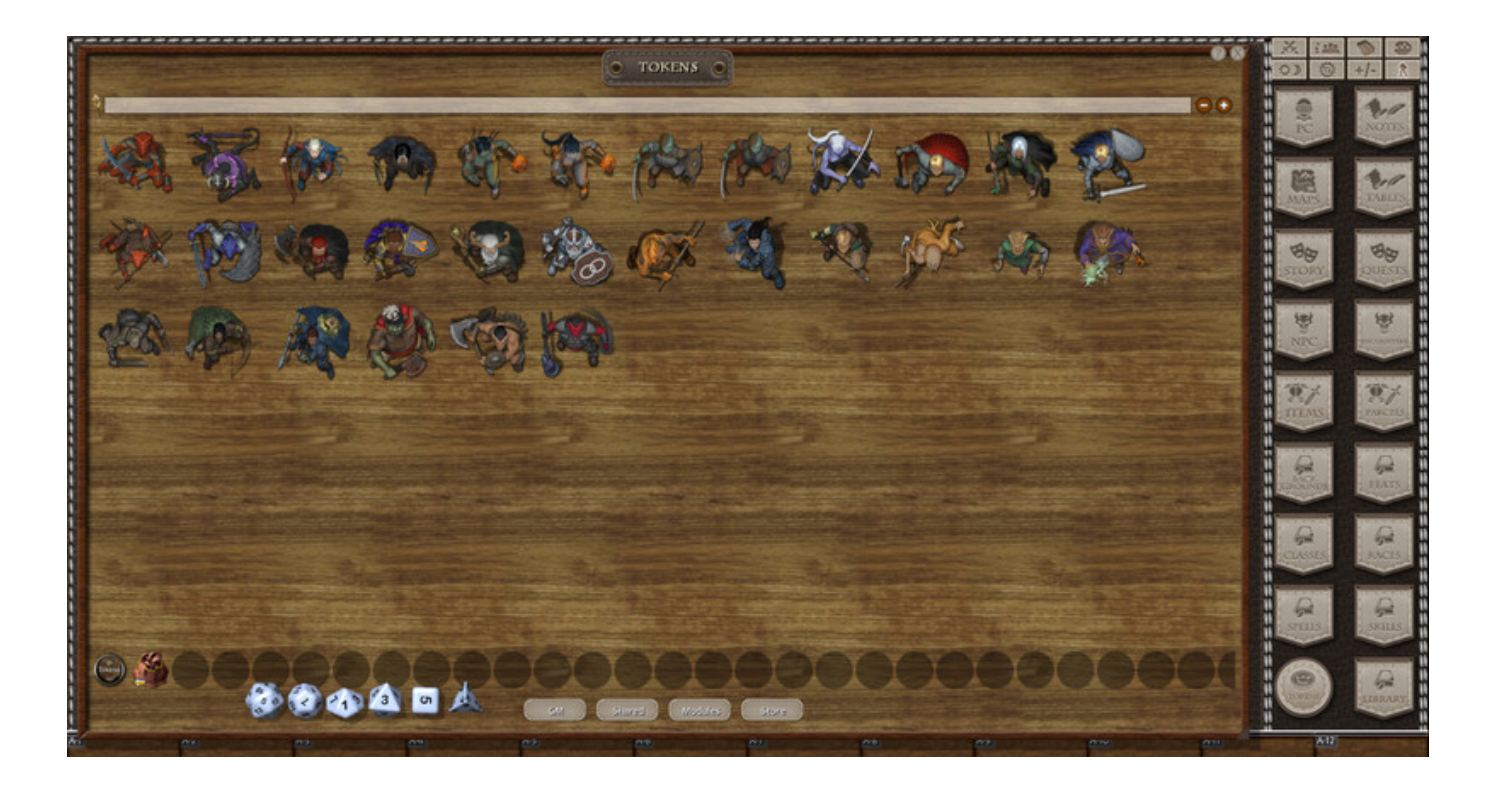
Fantasy Grounds - Heroic Characters 11 (Token Pack) Keygen Download

Download ->>> <a href="http://bit.ly/2SIPf6c">http://bit.ly/2SIPf6c</a>